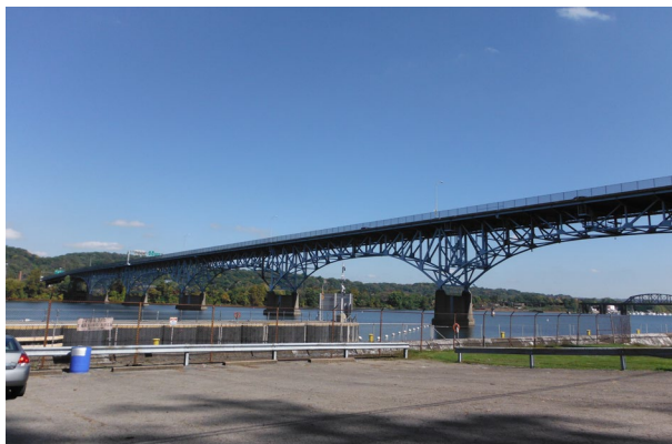
Highland Park Bridge