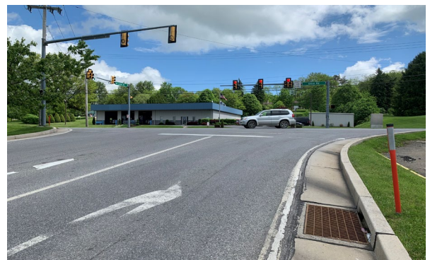
PA 756 – Luther Road