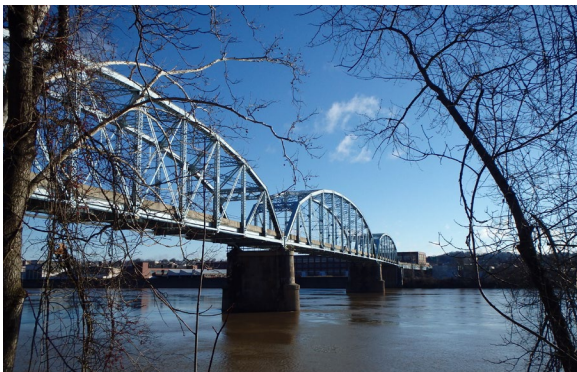
New Kensington Bridge