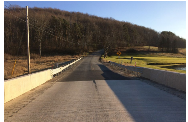
PA Statewide Bridge Replacements – JV 565