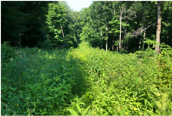
A-1 Pipeline ROW West