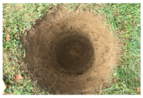
Greenbag Road Project Monongalia County, WV