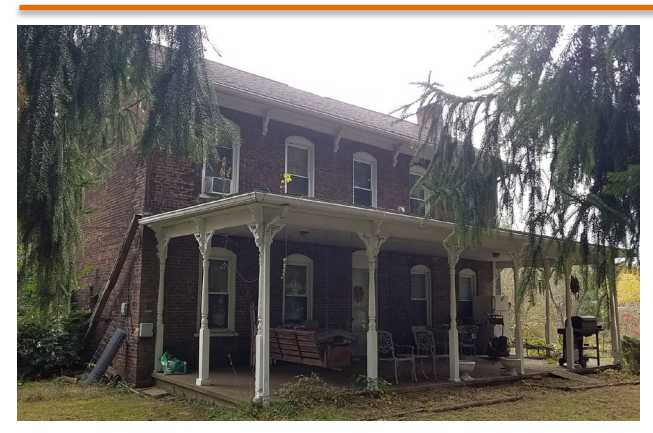
Greenbag Road Project Monongalia County, WV