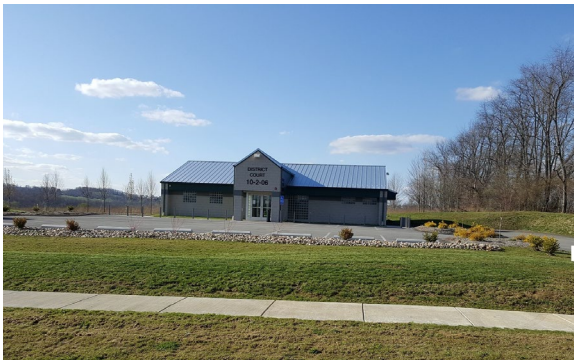
Rostraver Township District Justice Office