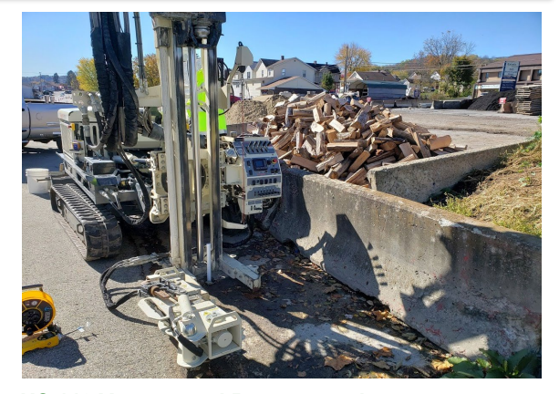
US 119 Youngwood Reconstruction Westmoreland County, PA