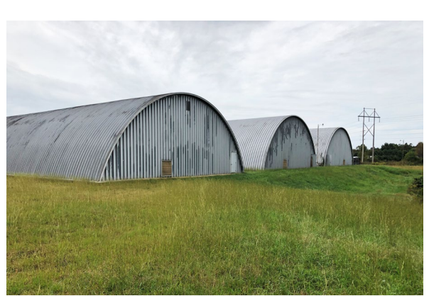
Former Plastics Warehouse Little Hocking, OH