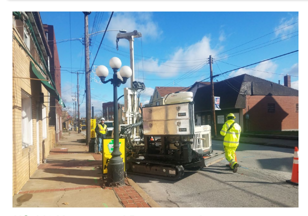
US 119 Youngwood Reconstruction Westmoreland County, PA