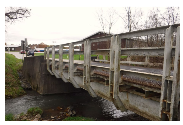
Chartiers Bridge #53 Washington County, PA