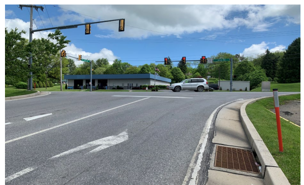
PA 756 – Luther Road