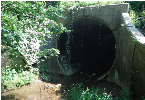
Watters Street Culvert