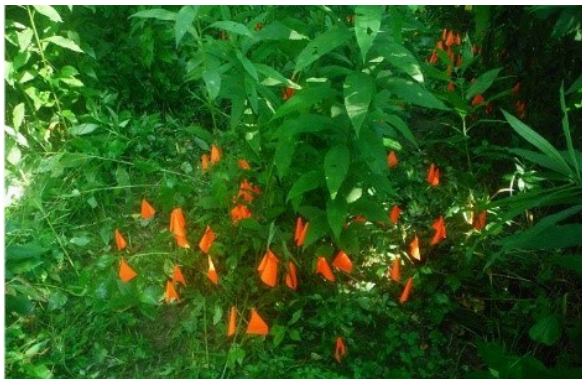
Margaret Road Intersection