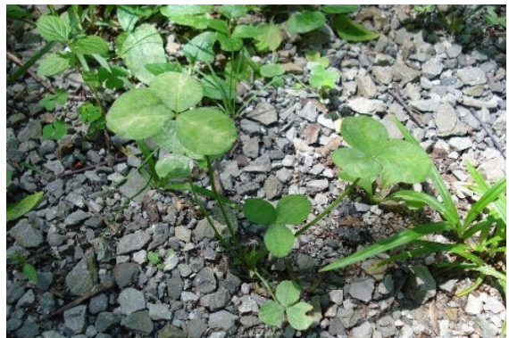
Natural Gas Pipeline Routing