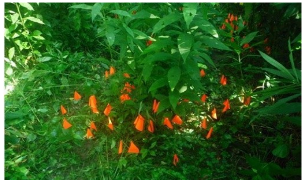
Running Buffalo Clover Survey

Brooke County, WV & Washington County, PA