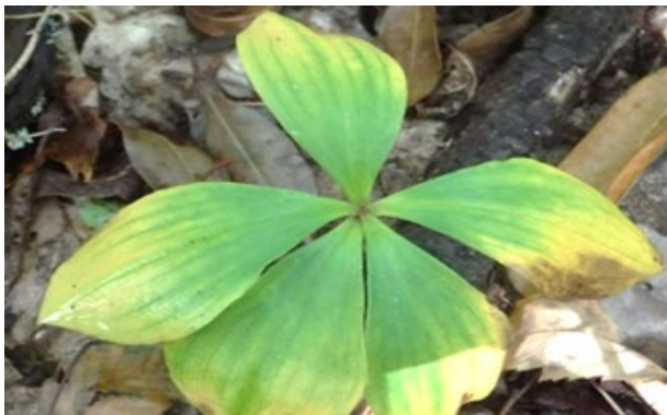
Corridor H Parsons to Davis