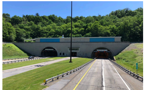
Tuscarora Tunnels Franklin and Huntington Counties, PA