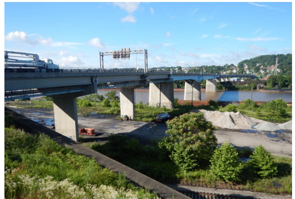
Clairton-Glassport Bridge Allegheny County, PA