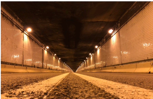
Allegheny Tunnel Somerset County, PA