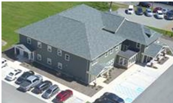
Robb Farm, LLC Office Building