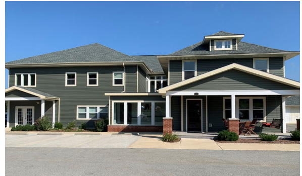
Robb Farm, LLC Office Building