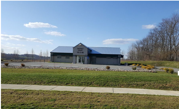
Rostraver Township District Justice Office