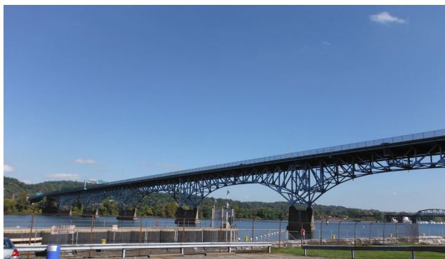
Highland Park Bridge