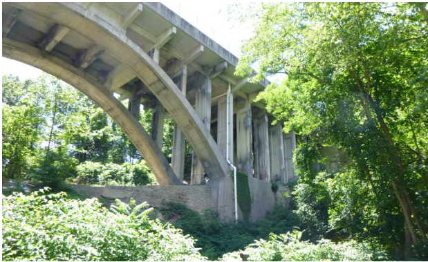
SR 65 Over Spruce Run