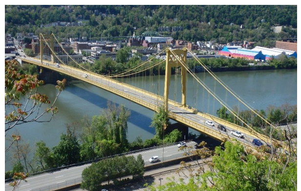
South 10 th Street Bridge