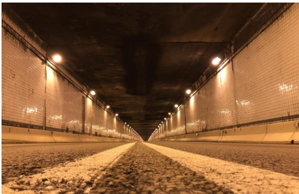
Allegheny Tunnel Somerset County, PA