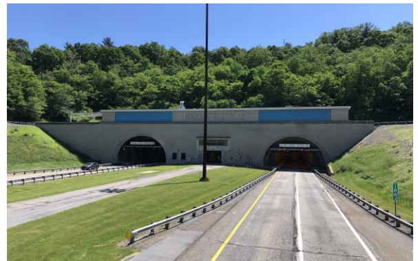
Tuscarora Tunnels Franklin and Huntington Counties, PA