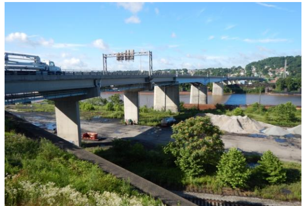
Clairton-Glassport Bridge Allegheny County, PA