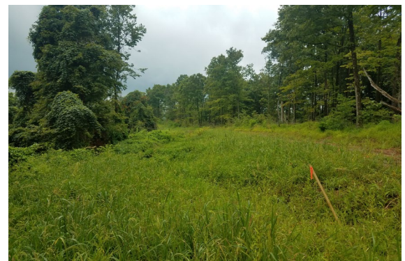
Stingray Compressor Station