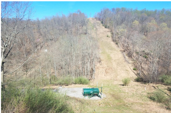
Wetzel County Gathering Expansion