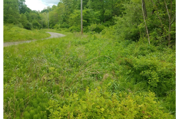
H312 Pipeline Replacement